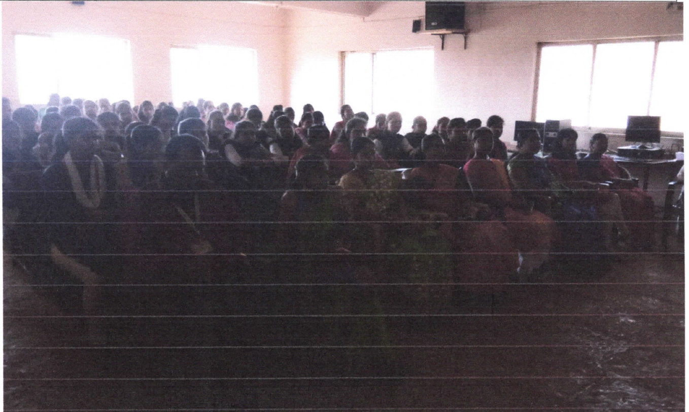
Students and Parents for the function